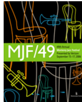
49th Annual Monterey Jazz Festival Poster

This week-long festival showcases both traditional and contemporary music from many of the world's diverse cultures. More than 70 concerts will be held in more than 20 venues across Chicago. Festival events include a mix of free and ticketed concerts, live radio broadcasts and educational workshops in a variety of venues throughout the city. For more information, call the World Music Festival: Chicago 2006 hotline at 312-742-1938 or click here .