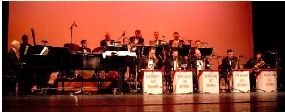
New England Jazz Ensemble

Stay tuned for more exciting concerts and events in October's Take Note .